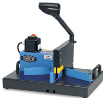
EM 3 Ecoline