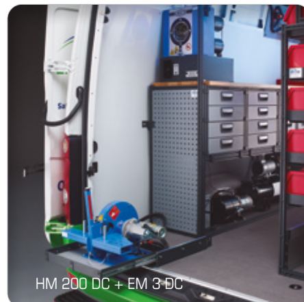
HM 200 DC + EM 3-DC